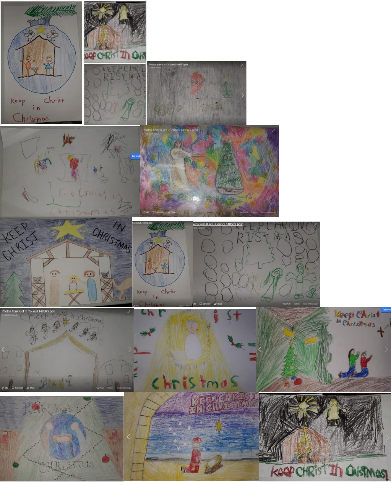
Christmas Caroling on Dilloway